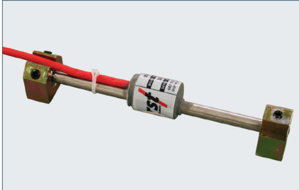
Vibrating Wire Arc Weldable Strain Gauge